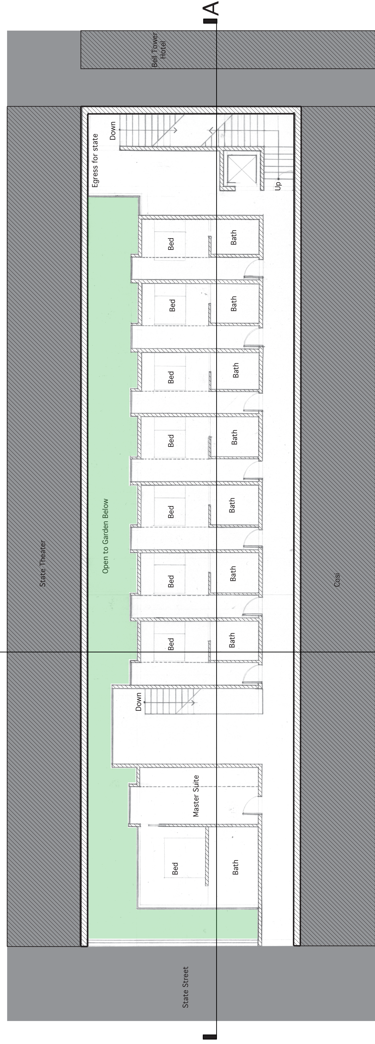
Second Floor Plan 1/8"=1'-0"